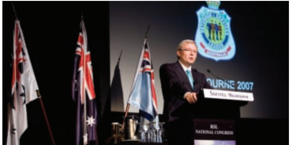
Kevin Rudd speaking at the RSL National Congress in Melbourne.

The issue of erosion of disability compensation pensions has been a major issue of concern for the ex-service community. In fact, there has been no other issue that has been subject of greater sustained and passionate concern in the Veterans' Affairs policy area over the last ten years.