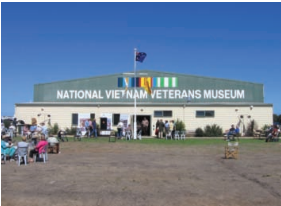
Opening of the National Vietnam Veterans Museum.

This museum belongs to all Vietnam Veterans and pays tribute to all those who served in Vietnam. The Museum is open to the public 7 days a week and can be contacted on 03 5956 6400 or via email vvmuseum@nex.net.au .