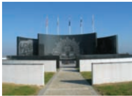
The Australian Memorial at La Hamel which now needs to be reconstructed due to extensive damage.